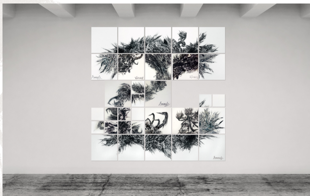
"F-R-1a" is a 109" x 109" combination of eight pre-existing "Fracture" paintings.