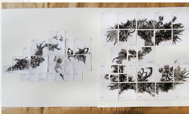
Hornsby's discovery process begins with experimenting with table-top "sketches."