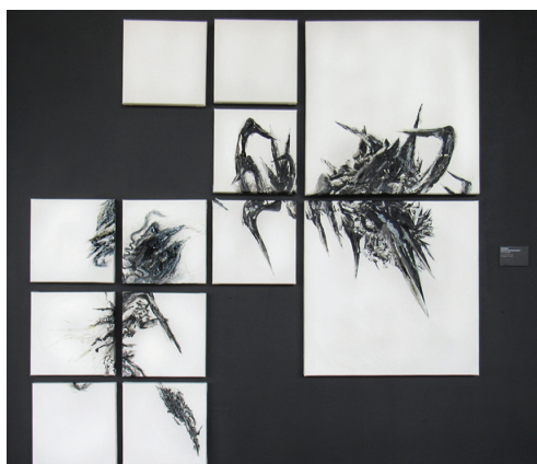
Fracture: Recontextualized F-R-1 (c) 2018 54" x 54", Acrylic, ink, and paper on canvas